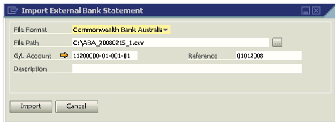
Importing Payments to SAP Business One